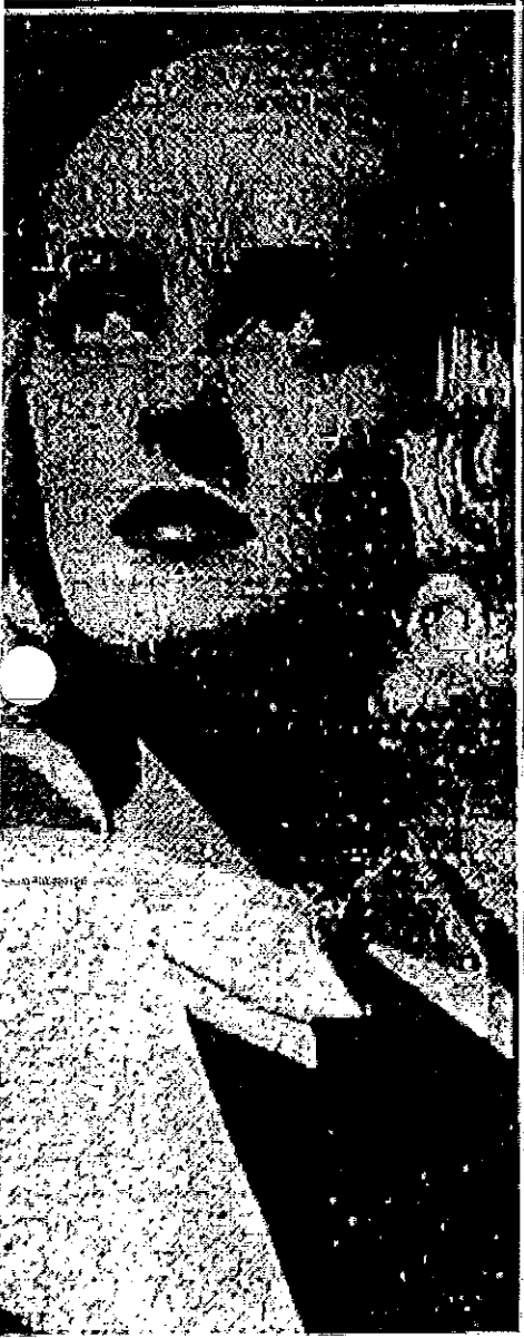
Miss Bette Davis has the role of (l) reporter in her newest picture, called "Front Page."